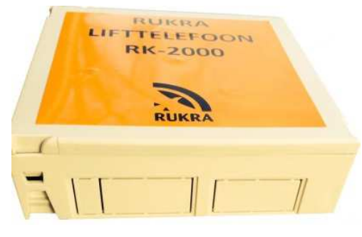
Installation Box(RK-2015) OPTION